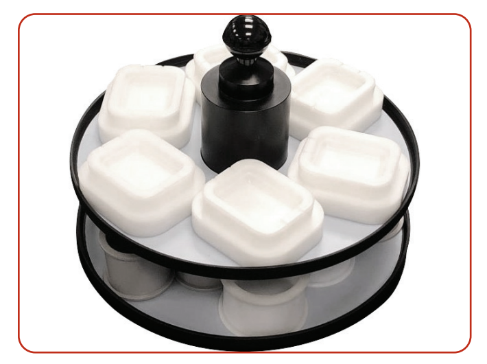
Unique stacking tray design