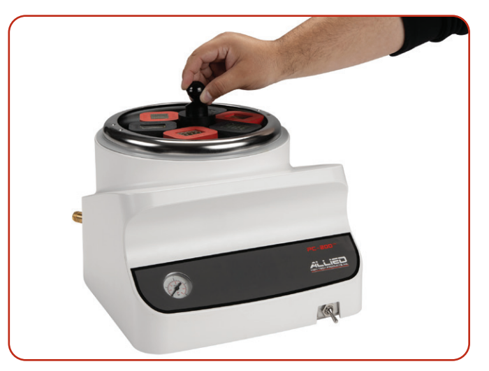
Can fit three (3) stackable trays inside the chamber