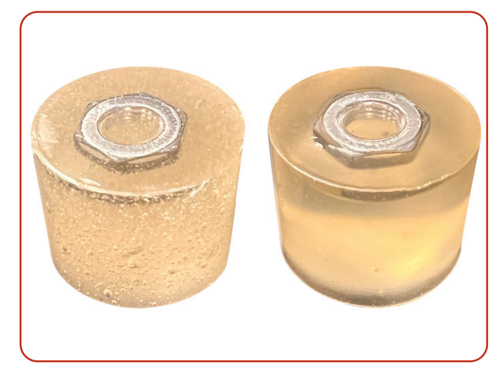
Acrylic samples mounted without & with pressure chamber