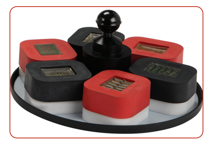
Stacking tray with PTFE lining for easier cleanup