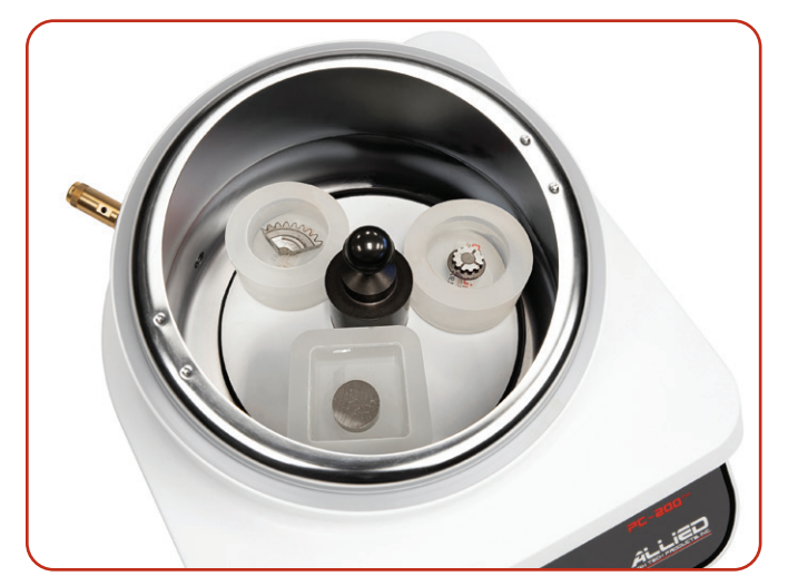
Chamber that easily holds oversized samples