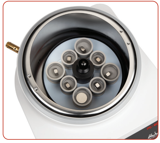
Large chamber accommodates multiple samples